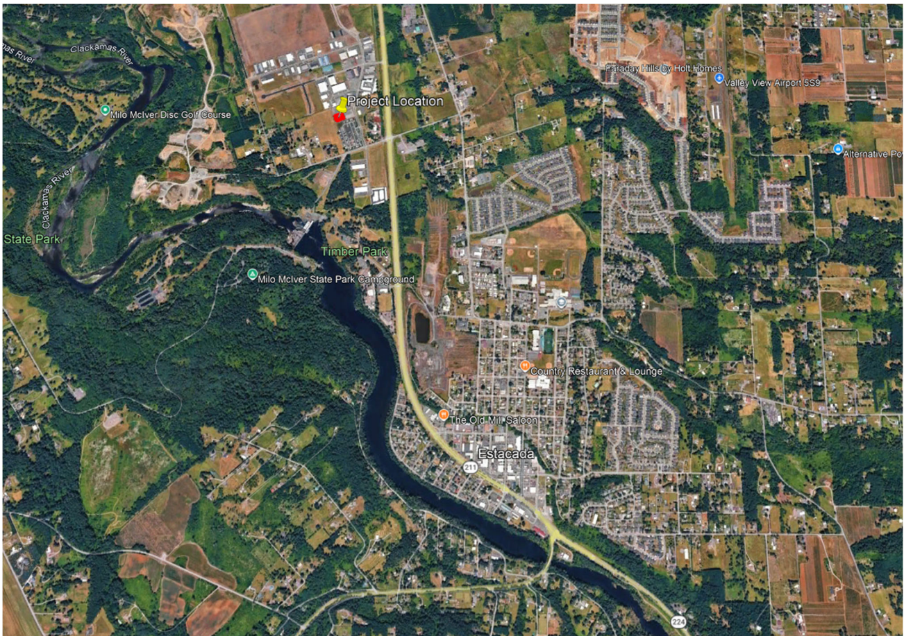
Figure 1: Vicinity of 4" overlay at District 2C office

This project is located at location identified in the pictures below: